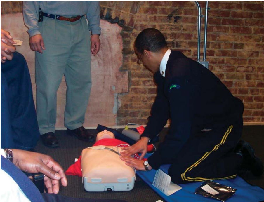
Above: A Public Safety Guide practices compressions under the guidance of a Lifework instructor.